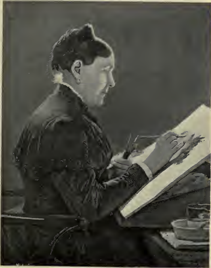
THE PRINCESS MATHILDE IN LATER LIFE. (After Doucet.)